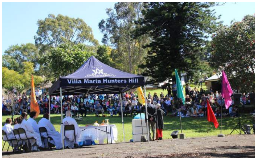
Left: School leavers' sign at Marist Sisters' College, Woolwich. Above: HNM feast day Mass, Villa Maria. Below: Barbecue collusion, Villa Maria?