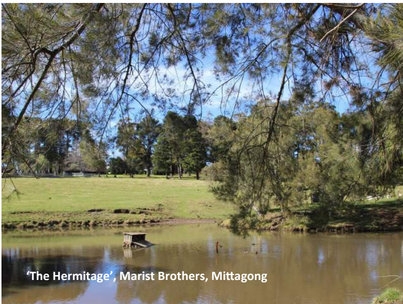
'The Hermitage', Marist Brothers, Mittagong

Wills and Bank Accounts: A recently deceased Marist left everything to the Province. Unfortunately, he had two accounts in his own name and not in the name of the Marist Fa-