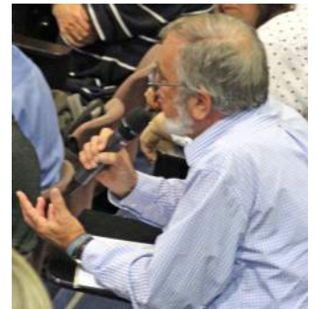
Top: As Australia and NZ focus on World War I and Anzac centenaries, the combined Marist Family JPICC committee (pictured at one of its regular meetings) is preparing for an Aug 2015 event recalling the 'Forgotten Wars' against indigenous peoples on our own shores. | Above left: 2011-12 and 2013 graduates of the Bridge Program have begun recruiting for BP14-15, a fourth program leading to ACU's 2015 online studies course on the Thai-Burma border. | Above right: Members of the province JPICC committee attended the ACMRO (Migrants & Refugees) conference at ACU, North Sydney.